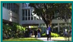
Ashe Administrative Building - Coral Gables